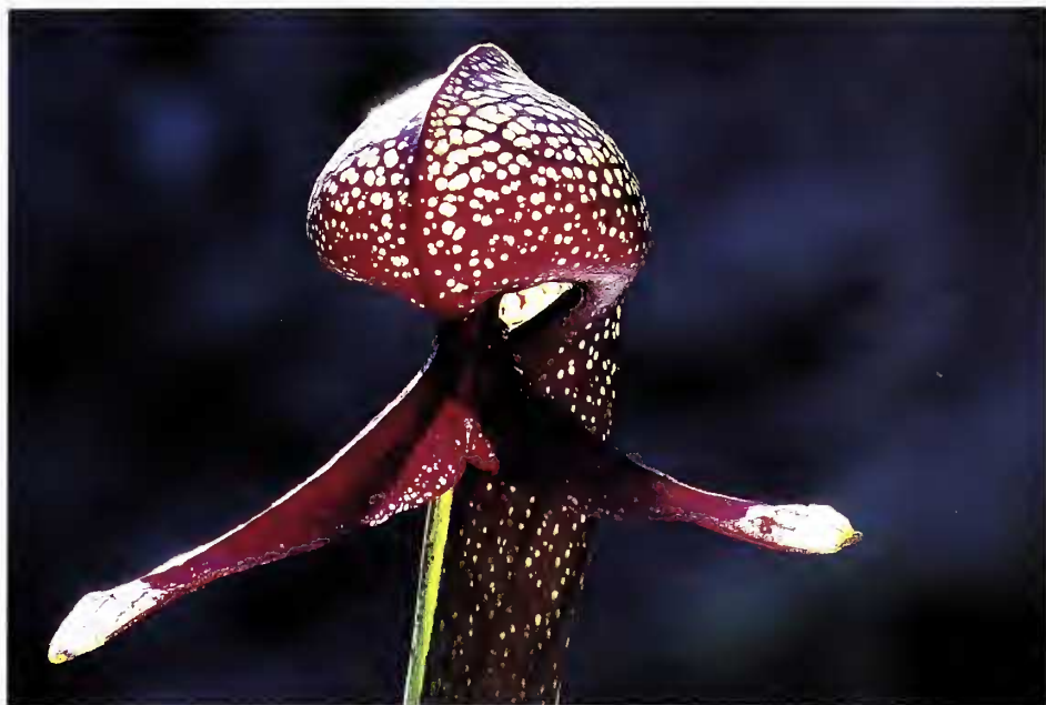
Figure 4: Darlingtonia : crimson pitcher variant.